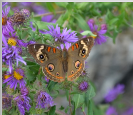
Common Buckeye on Aster

— Nathaniel Hawthorne, The American Notebooks