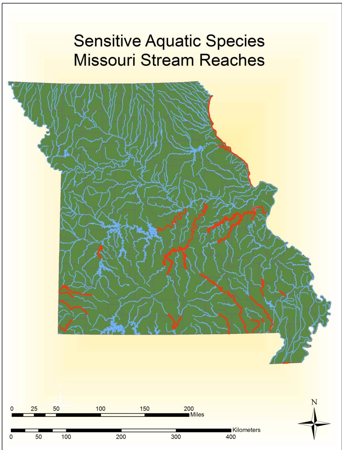
Figure 1. Location of affected streams within Missouri.