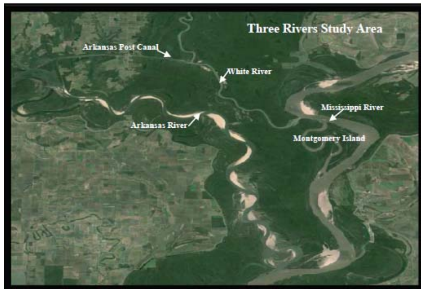
Figure 1. Three Rivers Study Area

b. Study/Project Description. The Federally authorized Three Rivers Feasibility Study area (Figure 1) is located at the confluence of the Mississippi, White, and Arkansas rivers in Desha and Arkansas counties, in southeast Arkansas, along the McClellan-Kerr Arkansas River Navigation System (MKARNS). The feasibility study will analyze alternatives that would inhibit cutoff development and recommend a long-term solution that allows for continued, safe, and economic use of the MKARNS and is environmentally sustainable. The cost-sharing, non-Federal sponsor is the Arkansas Waterways Commission.