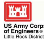
Table Rock Lake Shoreline Management Plan Revision and Environmental Assessment

Please use this form to provide comments and suggestions about how you would like to see the Table Rock Lake Shoreline Management Plan revised or on the issues that should be studied before a decision is made on Shoreline Management Plan revisions. Feel free to take an extra form to provide to friends or neighbors and send the forms back before April 17 th , 2015 to USACE at the addresses below.