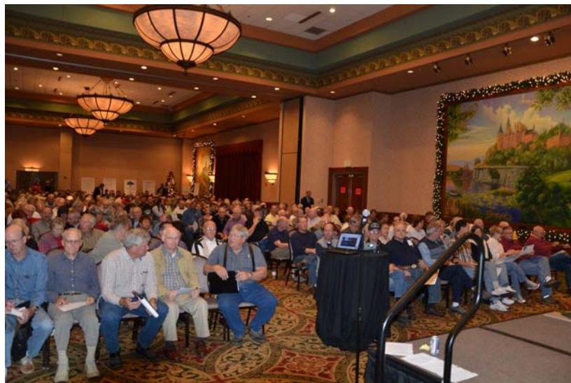
Figure 2-4. Workshop Attendance at Branson

The third workshop, the Branson workshop, had to be moved to accommodate the crowds. Due to the short notice, an alternate location that was within sight of the Visitors Center, but which could accommodate five times as many people was booked. A press release was sent to the news media on Friday, November 30, 2012, to notify people of the change in location. Missouri Department of Transportation loaned USACE two variable message signs that notified the public of the change in location. One sign was placed on the highway just south of the Visitors Center and the other was placed on the highway north of the dam just before the driveway into the Chateau. People approaching the Visitors Center from the north would have to pass the Chateau before arriving at the Visitors Center and so this sign would have alerted them of the change before crossing the dam. Large poster board signs were also