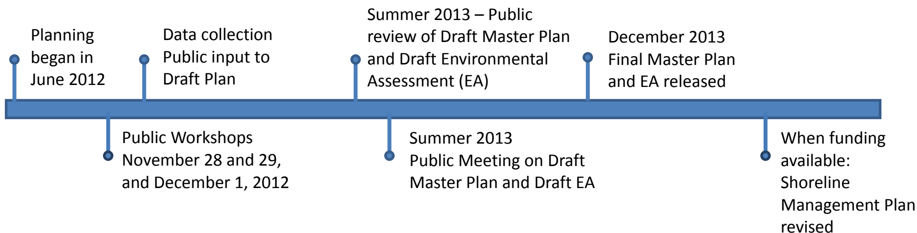
Table Rock Lake Master Plan Revision Timeline