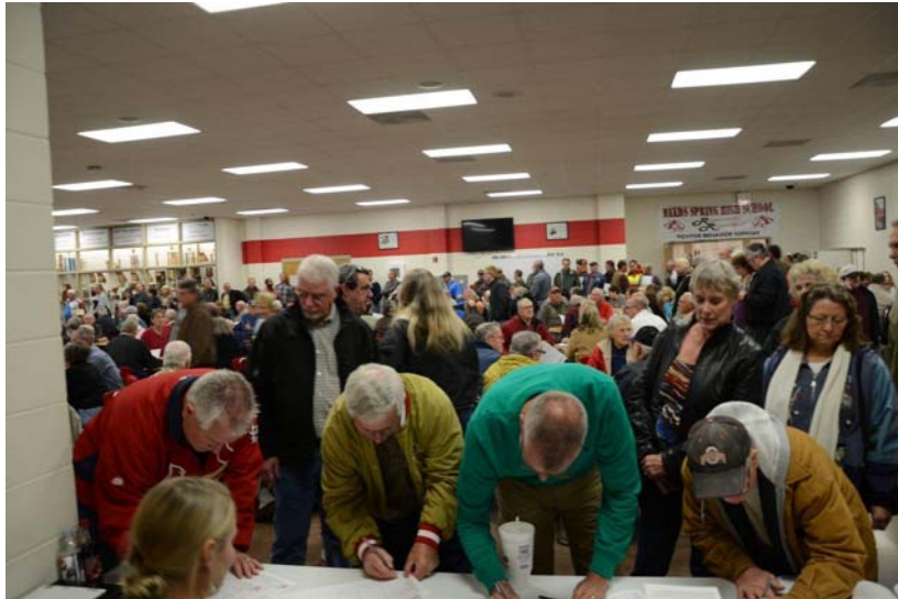
Figure 2-1. Registration Table at Reeds Spring Workshop