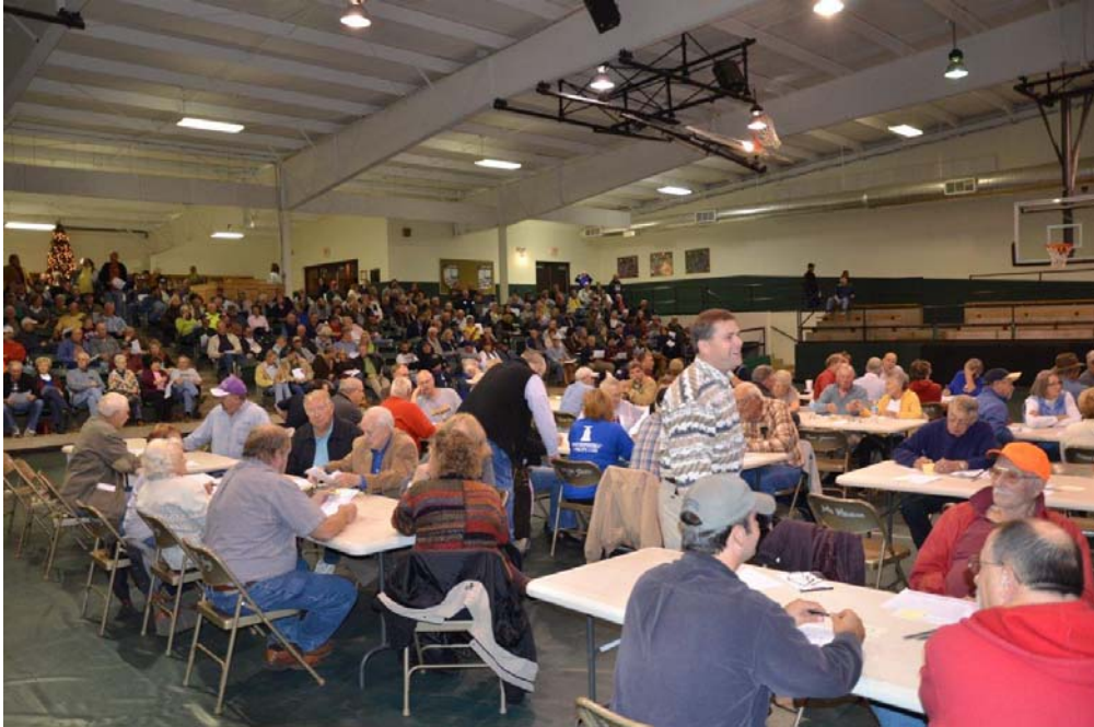
Figure 2-3. Workshop Attendance at Shell Knob