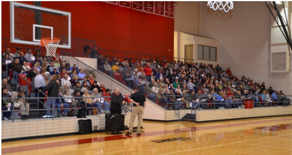
Figure 2-2. Workshop Attendance at Reeds Spring