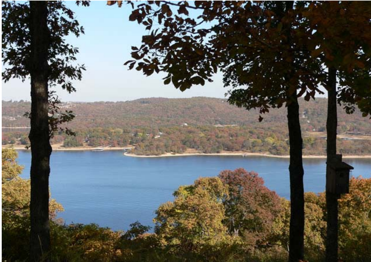
Table Rock Lake Master Plan Update