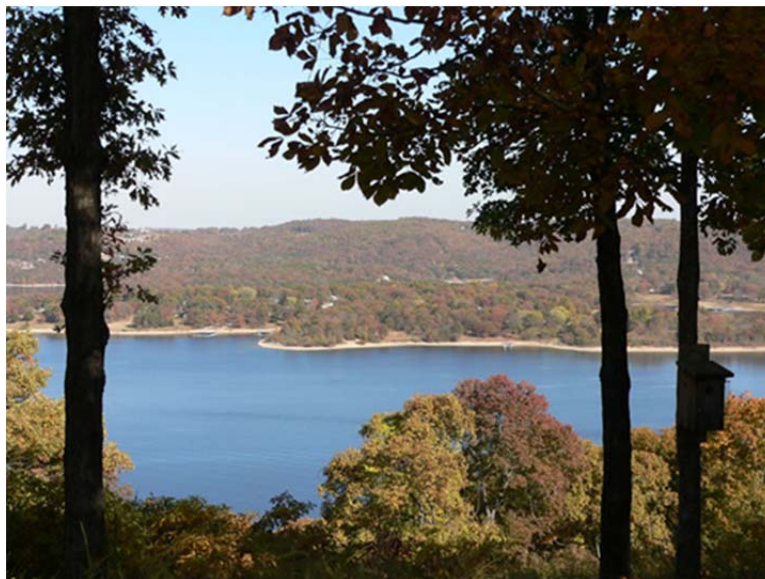
Figure 1-1. Table Rock Lake

Table Rock Lake was authorized for flood control (PL 77-228, PL 75-761), water supply (PL 85-500), fish and wildlife (PL 77-228, PL 85-624, PL 75-761), hydroelectric power (PL 77-228, PL 75-761), and recreation (PL 77-228, PL 75-761) purposes.. Table Rock lake is operated during flood periods in conjunction with other lakes in the basin to prevent damage along the White and lower Mississippi Rivers. It is a major unit in a comprehensive plan for the development and management of water resources in the White River basin in Missouri and Arkansas. In addition to the power generated at the Table Rock Lake dam, the regulated flow from the lake provides for increased output from the downstream Empire District Electric Company and the Bull Shoals power stations.