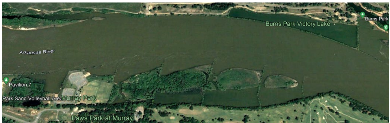
Figure 3. Conceptual Condition of a Partially Filled-in Dike Field (2004)