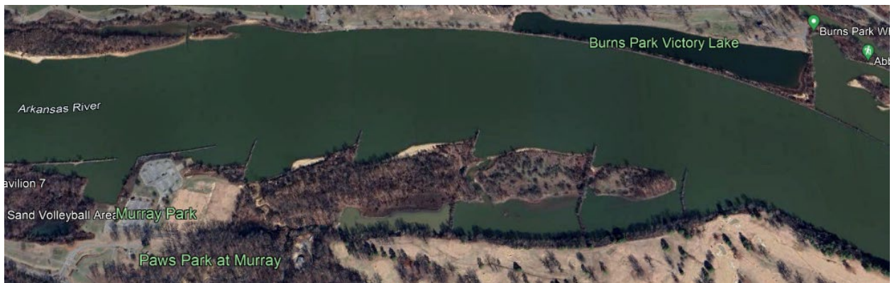
Figure 4. Conceptual Condition of a Filled-in Dike Field (2023)