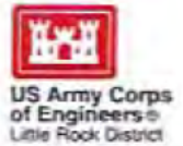
Table Rock Lake Master Plan Revision and Environmental Assessment

Please use this form to respond to the following three questions that will be asked in this workshop. You may also use this form to provide additional comments about how you would like to see the Table Rock Lake Master Plan revised or on the issues that should be studied before a decision is made on Master Plan revisions. Feel free to take an extra form and send it back later to USACE at the addresses below.