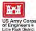
Table Rock Lake Master Plan Revision and Environmental Assessment

Please use this form to respond to the following three questions that will be asked in this workshop. You may also use this form to provide additional comments about how you would like to see the Table Rock Lake Master Plan revised or on the issues that should be studied before a decision is made on Master Plan revisions. Feel free to take an extra form and send it back later to USACE at the addresses below.