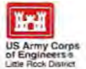
Table Rock Lake Master Plan Revision and Environmental Assessment

Please use this form to respond to the following three questions that will be asked in this workshop. You may also use this form to provide additional comments about how you would like to see the Table Rock Lake Master Plan revised or on the issues that should be studied before a decision is made on Master Plan revisions. Feel free to take on extra form and send it back later to USACE at the addresses below.