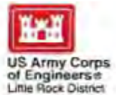
Table Rock Lake Master Plan Revision and Environmental Assessment

Please use this form to respond to the following three questions that will be asked in this workshop. You may also use this form to provide additional comments about how you would like to see the Table Rock Lake Master Plan revised or on the issues that should be studied before a decision is made on Master Plan revisions. Feel free to take an extra form and send it back later to USACE at the address below.