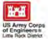
Table Rock Lake Master Plan Revision and Environmental Assessment

Please use this form to respond to the following three questions that will be asked in this workshop. You may also use this form to provide additional comments about how you would like to see the Table Rock Lake Master Plan revised or on the issues that should be studied before a decision is made on Master Plan revisions. Feel free to take an extra form and send it back later to USACE at the addresses below.