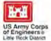
Table Rock Lake Master Plan Revision and Environmental Assessment

Please use this form to respond to the following three questions that will be asked in this workshop. You may also use this form to provide additional comments about how you would like to see the Table Rock Lake Master Plan revised or on the issues that should be studied before a decision is made on Master Plan revisions. Feel free to take an extra form and send it back later to USACE at the addresses below.