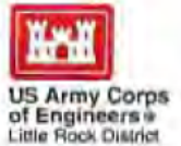
Table Rock Lake Master Plan Revision and Environmental Assessment

Please use this form to respond to the following three questions that will be asked in this workshop. You may also use this form to provide additional comments about how you would like to see the Table Rock Lake Master Plan revised or on the issues that should be studied before a decision is made on Master Plan revisions. Feel free to take an extra form and send it back later to USACE at the addresses below.