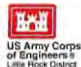
Table Rock Lake Master Plan Revision and Environmental Assessment

Please use this form to respond to the following three questions that will be asked in this workshop. You may also use this form to provide additional comments about how you would like to see the Table Rock Lake Master Plan revised or on the issues that should be studied before a decision is made on Master Plan revisions. Feel free to take an extra form and send it back later to USACE at the addresses below.