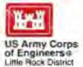
Table Rock Lake Master Plan Revision and Environmental Assessment

Please use this form to respond to the following three questions that will be asked in this workshop. You may also use this form to provide additional comments about how you would like to see the Table Rock Lake Master Plan revised or on the issues that should be studied before a decision is made on Master Plan revisions. Feel free to take an extra form and send it back later to USACE at the addresses below.