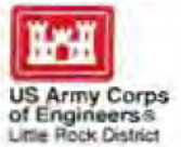
Table Rock Lake Master Plan Revision and Environmental Assessment

Please use this form to respond to the following three questions that will be asked in this workshop. You may also use this form to provide additional comments about how you would like to see the Table Rock Lake Master Plan revised or on the issues that should be studied before a decision is made on Master Plan revisions. Feel free to take an extra form and send it back later to USACE at the addresses below.