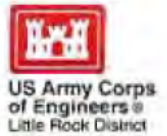
Table Rock Lake Master Plan Revision and Environmental Assessment

Please use this form to respond to the following three questions that will be asked in this workshop. You may also use this form to provide additional comments about how you would like to see the Table Rock Lake Master Plan revised or on the issues that should be studied before a decision is made on Master Plan revisions. Feel free to take an extra form and send it back later to USACE at the addresses below.