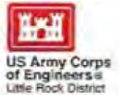
Table Rock Lake Master Plan Revision and Environmental Assessment

Please use this form to respond to the following three questions that will be asked in this workshop. You may also use this form to provide additional comments about how you would like to see the Table Rock Lake Master Plan revised or on the issues that should be studied before a decision is made on Master Plan revisions. Feel free to take an extra form and send it back later to USACE at the addresses below.