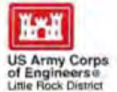
Table Rock Lake Master Plan Revision and Environmental Assessment

Please use this form to respond to the following three questions that will be asked in this workshop. You may also use this form to provide additional comments about how you would like to see the Table Rock Lake Master Plan revised or on the issues that should be studied before a decision is made on Master Plan revisions. Feel free to take an extra form and send it back later to USACE at the addresser below.