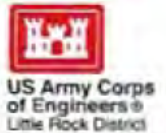
Table Rock Lake Master Plan Revision and Environmental Assessment

Please use this form to respond to the following three questions that will be asked in this workshop. You may also use this form to provide additional comments about how you would like to see the Table Rock Lake Master Plan revised or on the issues that should be studied before a decision is made on Master Plan revisions. Feel free to take an extra form and send it back later to USACE at the addresses below.