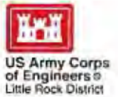
Table Rock Lake Master Plan Revision and Environmental Assessment

Please use this form to respond to the following three questions that will be asked in this workshop. You may also use this form to provide additional comments about how you would like to see the Table Rock Lake Master Plan revised or on the issues that should be studied before a decision is made on Master Plan revisions. Feel free to take an extra form and send it back later to USACE at the addresses below.