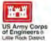
Table Rock Lake Master Plan Revision and Environmental Assessment

Please use this form to respond to the following three questions that will be asked in this workshop. You may also use this form to provide additional comments about how you would like to see the Table Rock Lake Master Plan revised or on the issues that should be studied before a decision is made on Master Plan revisions. Feel free to take an extra form and send it back later to USACE at the addresses below.