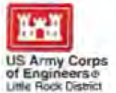
Table Rock Lake Master Plan Revision and Environmental Assessment

Please use this form to respond to the following three questions that will be asked in this workshop. You may also use this form to provide additional comments about how you would like to see the Table Rock Lake Master Plan revised or on the issues that should be studied before a decision is made on Master Plan revisions. Feel free to take an extra form and send it back later to USACE at the addresses below.