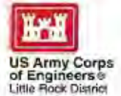
Table Rock Lake Master Plan Revision and Environmental Assessment

Please use this form to respond to the following three questions that will be asked in this workshop. You may also use this form to provide additional comments about how you would like to see the Table Rock Lake Master Plan revised or on the issues that should be studied before a decision is made on Master Plan revisions. Feel free to take an extra form and send it back later to USACE at the addresses below.