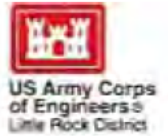
Table Rock Lake Master Plan Revision and Environmental Assessment

Please use this form to respond to the following three questions that will be asked in this workshop. You may also use this form to provide additional comments about how you would like to see the Table Rock Lake Master Plan revised or on the issues that should be studied before a decision is made on Master Plan revisions. Feel free to take an extra form and send it back later to USACE at the addresses below.