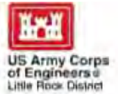
Table Rock Lake Master Plan Revision and Environmental Assessment

Please use this form to respond to the following three questions that will be asked in this workshop. You may also use this form to provide additional comments about how you would like to see the Table Rock Lake Master Plan revised or on the issues that should be studied before a decision is made on Master Plan revisions. Feel free to take an extra form and send it back later to USACE at the addresses below.